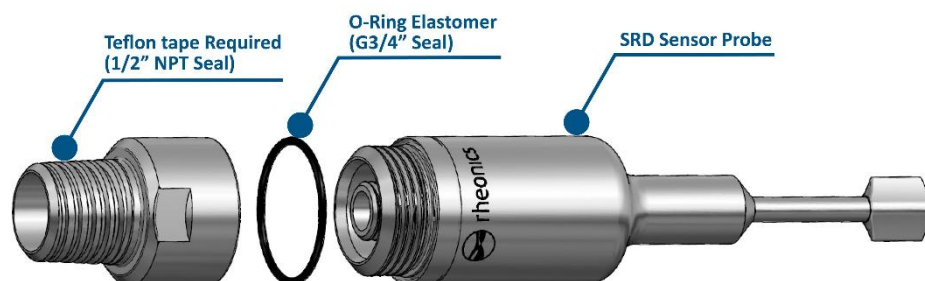
Figure 2. Required Seals for the installation