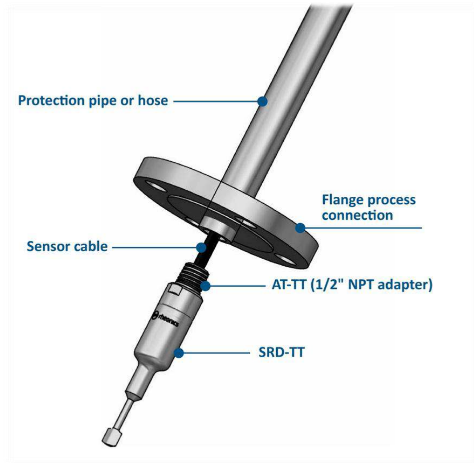
Figure 3. Probe parts