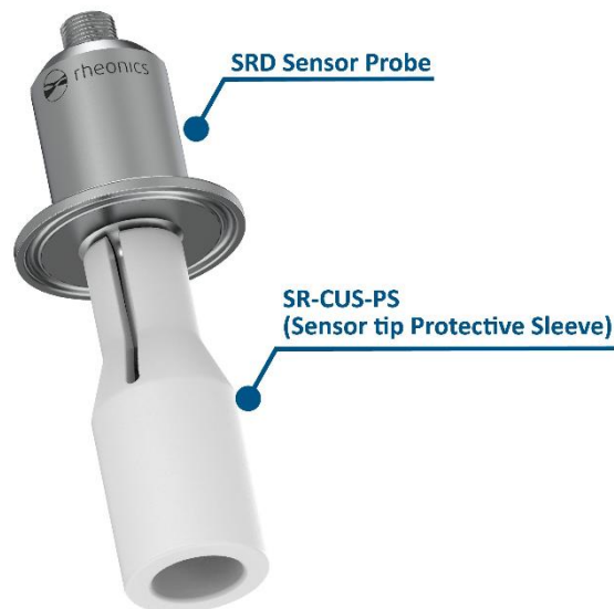
Figure 1. Example of the sensor tip protective sleeve