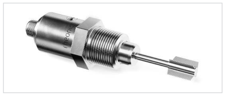
Figure 1: SRV (Wide Range Inline Viscometer)