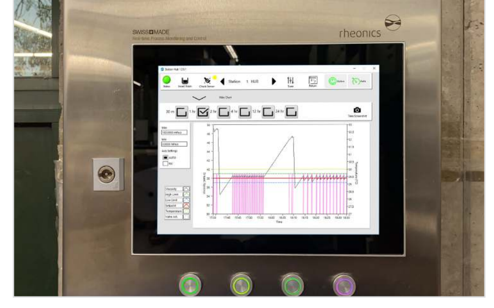
Figure 3: Turnkey integrated solution - Rheonics slurry monitoring and control system